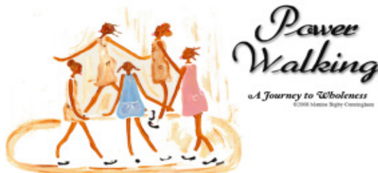
Staying on my feet "We can claim an alternative mind-set and reject victimization."