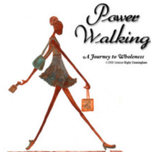
Walking Differently "It is my desire to be Whole - Willing... Walking."