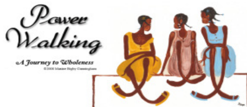
Getting on my feet "The most difficult part about getting on my feet is believing that I can."

Walking is both a daily experience and a life-time journey. When I get on my feet I experience pulling up as a strength-building exercise. When I take a step, I experience movement as aerobic training. When I stay on my feet, I experience balance as the result of proper breathing, posture and focus. I learned that I can walk and not be faint. Now, I walk differently. I am more prayerful, mindful, thankful, and joyful. Understanding that my God did not give me the spirit of fear, now I am power walking! p. xviii